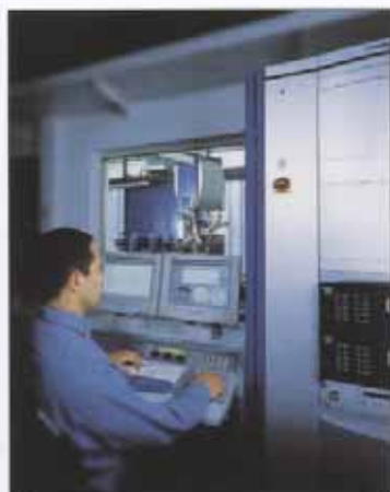
● AVL test cell operator's station.

“INtime's process model — the memory isolation and resulting protection — is crucial to maintaining the integrity of the system.”